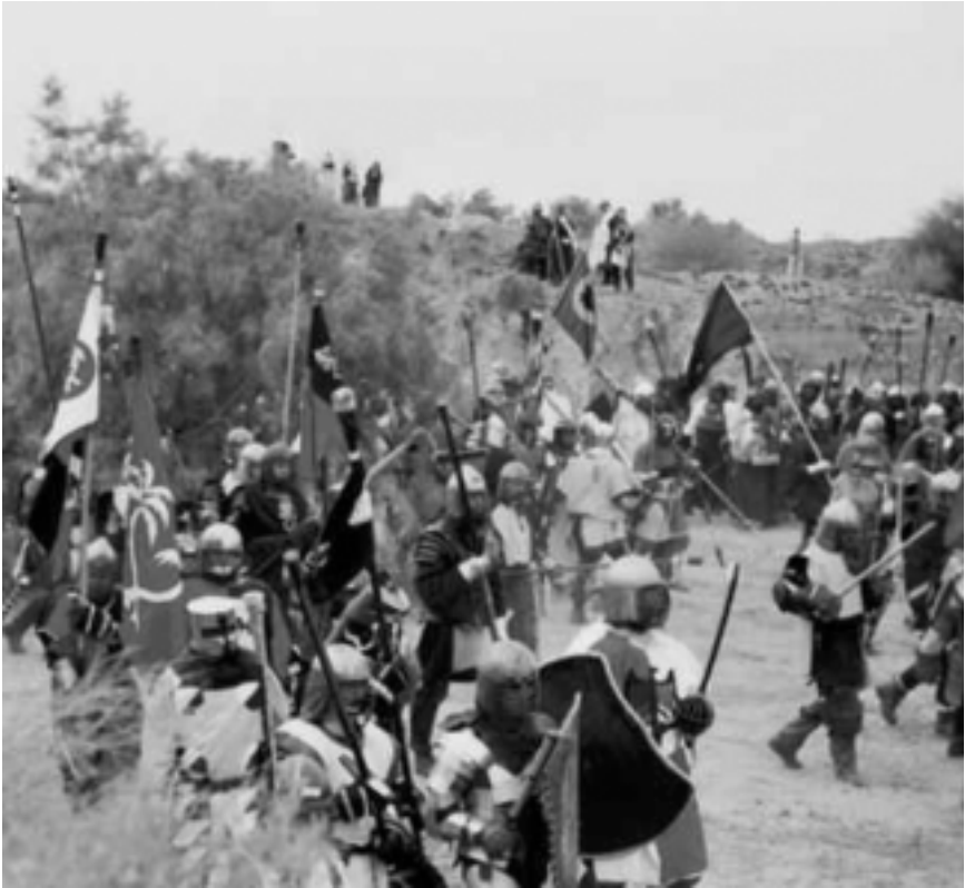
Hus Langskipp Guards marching into battle along side their allies, Wulfs Rudel. (Estrella War XVII, February, A.S. XXXV-2001)