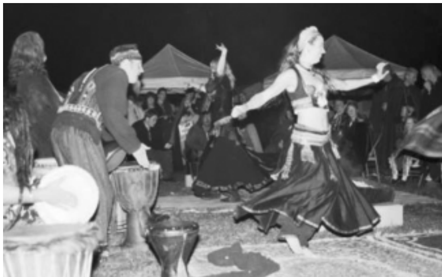
Members of Domba entertaining the crowd at the 2nd Annual Langskipp Cloven Fruit Revel. (Estrella War XVII, February, A.S. XXXV-2001)

of our three major universities are the home to smaller groups called Colleges, and there are eight Shires as well within the Kingdom, including the Shire of Londinium ad Rubrum Flumen in Lake Havasu City where the London Bridge makes its home.