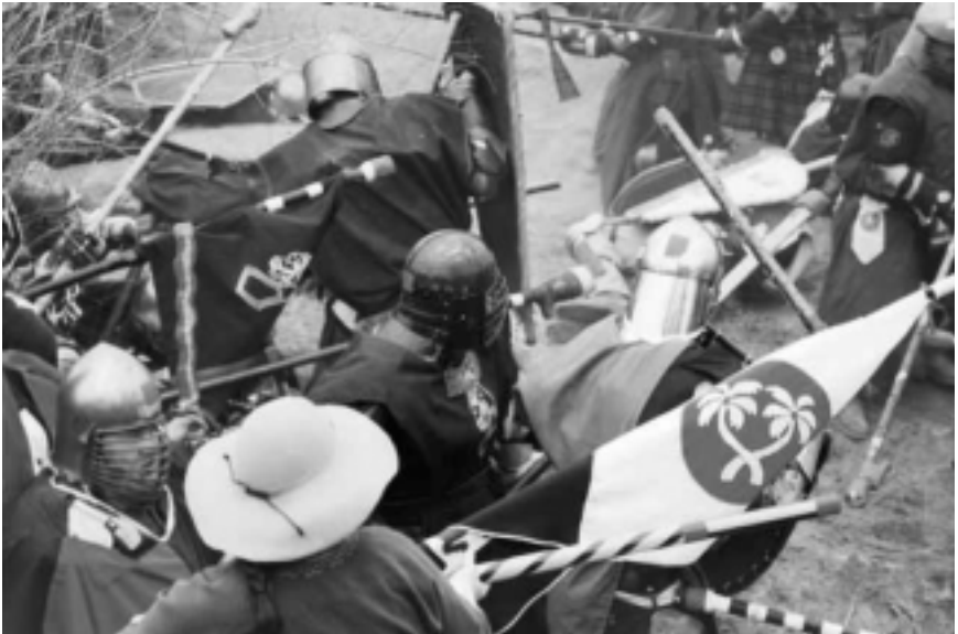
Hus Langskipp Guards and Wulfs Rudel at the center of a counter charge, which helped win this battle. (Estrella War XVII, February, A.S. XXXV-2001)

Not only is historical research a key to becoming good at whatever arts and sciences that you favor, but it is a requirement for creating a persona, which is your alter-ego within the SCA. When you register to become a member of the SCA, you must choose a name for yourself, design a personal coat of arms (or "device"), and give a historical background for your persona. There are many requirements involved for all of this, and it is no simple task, as it must be unique. However there are groups who will help the process along when you join. It is important to point out that you do not have to become a member of the SCA to enjoy its chivalry. It is estimated that for every registered member of the SCA in